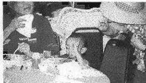
First Taste of Spaghetti