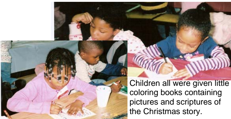
Children all were given little coloring books containing pictures and scriptures of the Christmas story.

In addition to serving approximately 250 people from five Washington DC area shelters, we had eight bags of toys left that were distributed, along with several boxes of warm coats to shelters in Petersburg, Hopewell, Dinwiddie, Colonial Heights, and Emporia, Virginia through CARES. Central Union Mission and a Mission in Baltimore, MD also were beneficiaries of the many warm coats.