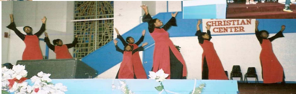
Greater Deliverance Christian Center Praise Dancers (left) brought the audience to their feet with praise.