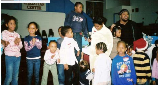
Sons of Thunder not only sang themselves, but allowed the children to come to the mics and sing & dance. They also helped distribute the toys.