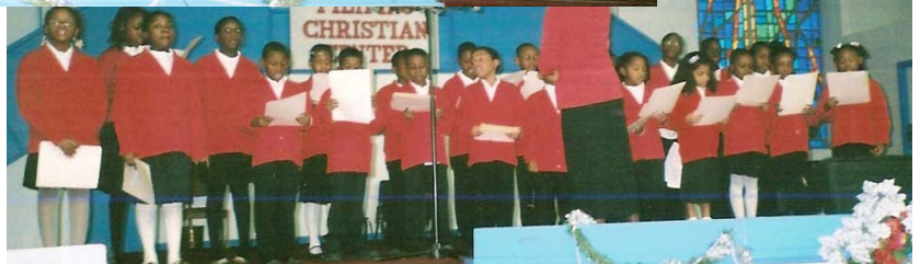
New Hope Christian Church Children's Choir