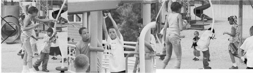
Children played with great excitement on the many-faceted playground equipment, a temporary respite from the crowded shelter conditions.