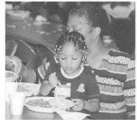
Concentrating on the spaghetti...

Besides the 238 backpacks distributed to the children from the shelters. 24 were given to children in a housing project in SW DC, and 15 to 5 other needy area families for a total of 278. To God be the Glory!