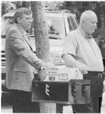
The Gideons (left) were present with testimony & New Testaments for all.