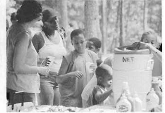
The line for food and drink was continual.