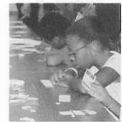
Concentrating on the arts and crafts . . .