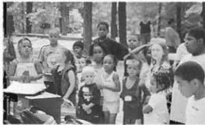
Children crowded around Sons of Thunder to listen and receive prizes.