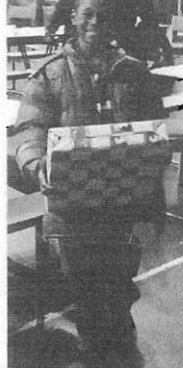
Families from five shelters were in attendance at the Christmas event.

*Note: We were able to include needy children who were not at our party from JC Nalle Elementary School, SE Washington, DC, as well as other needy area families in our toy distribution this year. Praise the Lord!