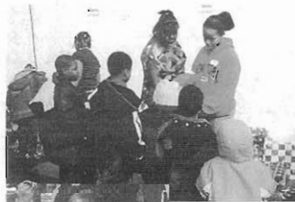
Above and left: Workers distributed a couple of hundred toys to the children of all ages who were in attendance at the

*Note: We were able to include needy children who were not at our party from JC Nalle Elementary School, SE Washington, DC, as well as other needy area families in our toy distribution this year. Praise the Lord!