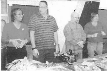
Above: lined up and ready to serve, volunteers led by the Fenwicks (not pictured) served a delicious Christmas banquet.