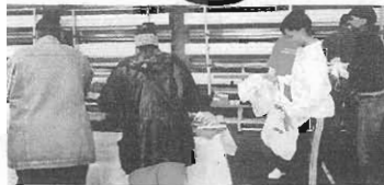
Mothers happy about the clothing "finds."