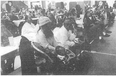
Above: Guests from the shelter watched the program intently.