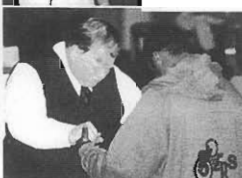
Many, many people, young and old came forward and gave their hearts to Christ.