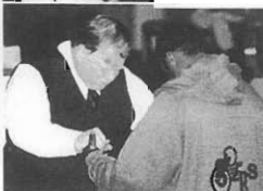
Many, many people, young and old came forward and gave their hearts to Christ.