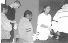
Volunteers served the delicious turkey dinner to the shelter residents.