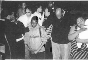
(Left) Many came forward to receive prayer. Prayer counselors were present from NCOG and