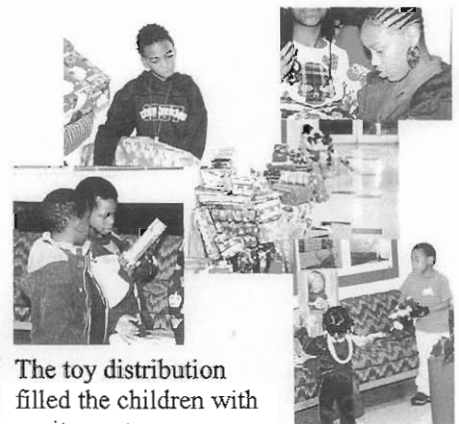
The toy distribution filled the children with excitement.