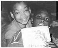
(below) Children happily display their coloring pages.