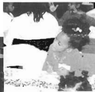
Christmas coloring books kept children and adults occupied.

Many tables were piled high with clothing. Mothers were able to gather large bagfuls of good quality clothing for their families.