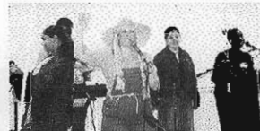
Praise & Worship Team