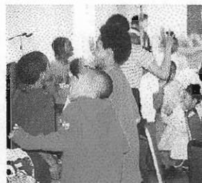
Dancing for Joy