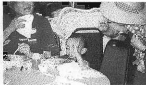
First Taste of Spaghetti