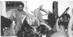
Hands Raised to Receive Christ